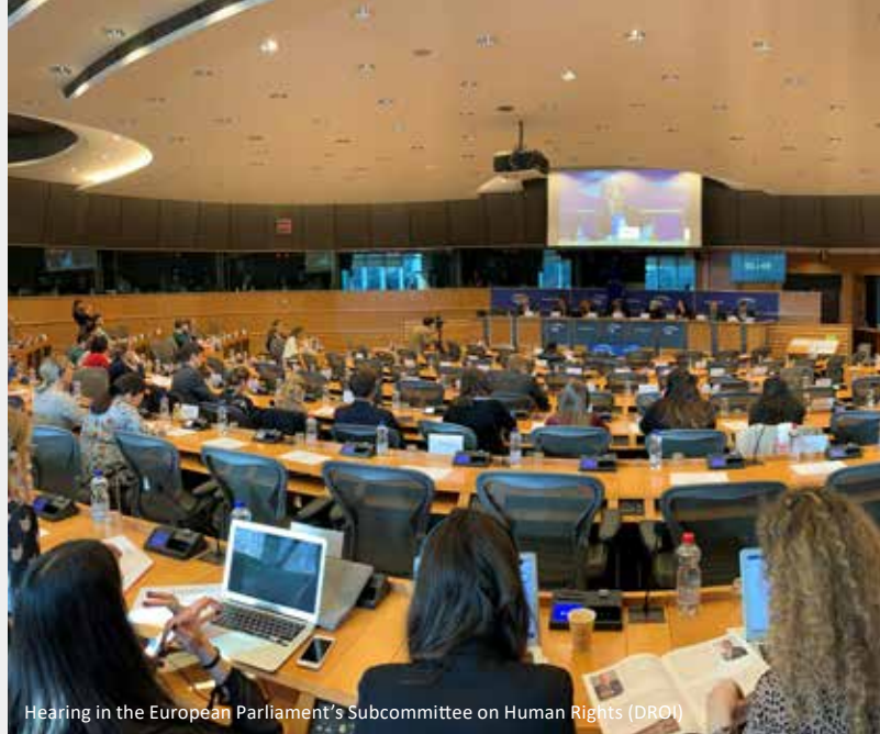
Hearing in the European Parliament’s Subcommittee on Human Rights (DROI)