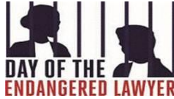
Foundation Day of the Endangered Lawyer