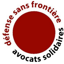
Défense Sans Frontière-Avocats Solidaires