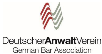
Germany / German Bar Association