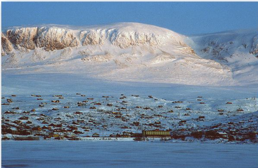
Renewing the Land Register Systems