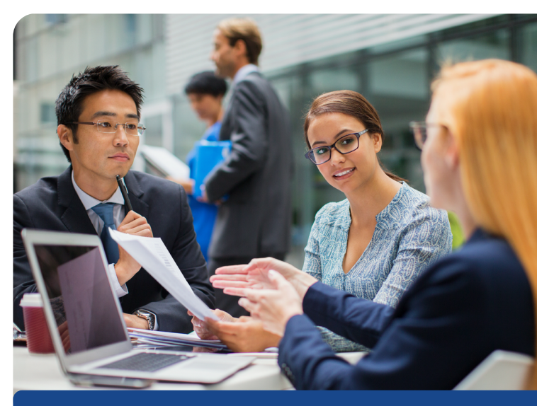
> More information about the work of the Committee

As to the more practical side, the focus areas include work-life balance, working culture, the attractiveness of the profession and technical developments, particularly from the perspective of young lawyers. More concrete actions in this respect are to follow as we have just started our work. I am really looking forward to executing our initiatives and continuing the work within the Committee.