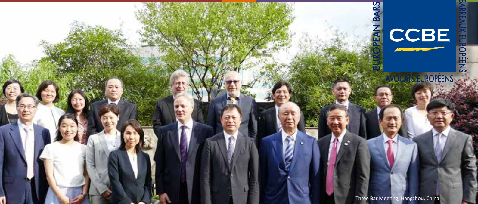
Three Bar Meeting, Hangzhou, China