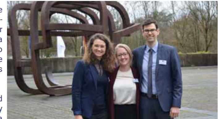
The winning team

31 contestants from 17 countries have been selected and grouped into teams of mixed nationalities. They were asked to submit their written reports followed by a negotiating exercise on company law, and a moot court exercise on criminal law.