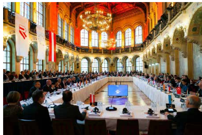
The European Presidents' Conference in Vienna

T he European Presidents' Conference, organised by the Austrian Bar (ÖRAK), has developed over decades into an important forum for dialogue. During the time of the so-called iron curtain this was very often the only possibility for contacts and exchange between lawyers from both sides. Nowadays the European Presidents' Conference is the most important meeting of the presidents of the bars and bar associations of the EU member states and neighbouring countries.