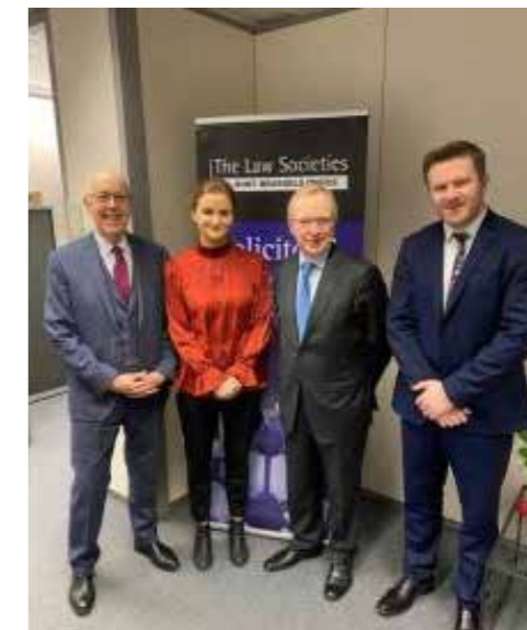
LSNI attend annual reception in Brussels