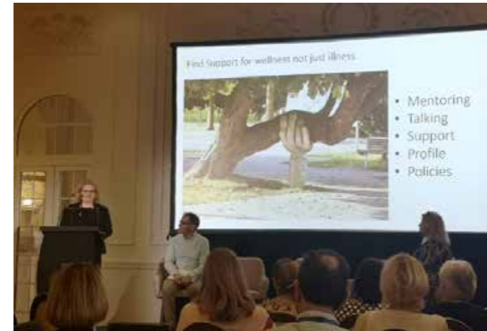
LSNI Four Jurisdictions Conference

Members of the Law Society of Northern Ireland's Presidential team, Council members and staff officers attended the Four Jurisdictions Family Law Conference in Malaga from Friday 31 January 2020 – Sunday 2nd February 2020. The overall theme of the conference was '25 years of Family Law'. The programme included sessions on the thorny issues facing practitioners involved in child law and financial remedies, led by internationally renowned judges and practitioners from across the various jurisdictions."