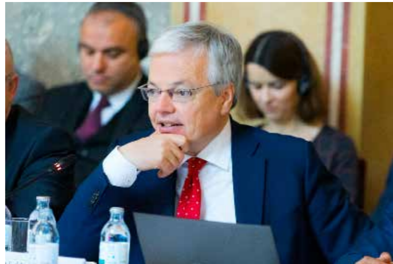
Didier Reynders